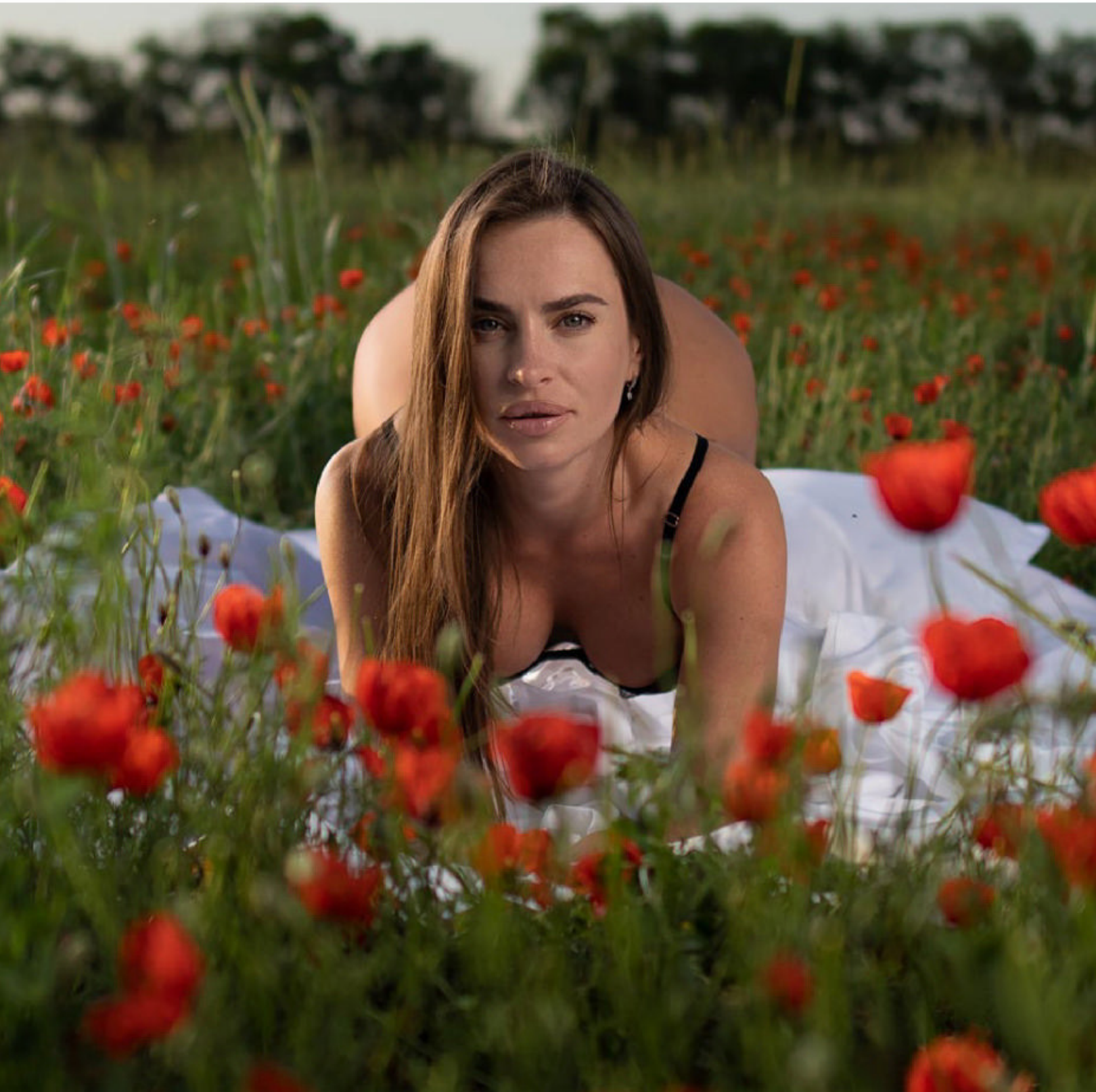
PHOTO SHOOT IN POPPIES